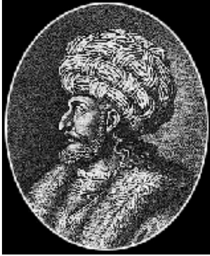
Saladin , Kurdish born champion of the Muslims against The Crusaders