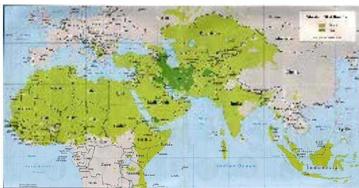
Map of Islamic Union/Caliphate/Khilafah